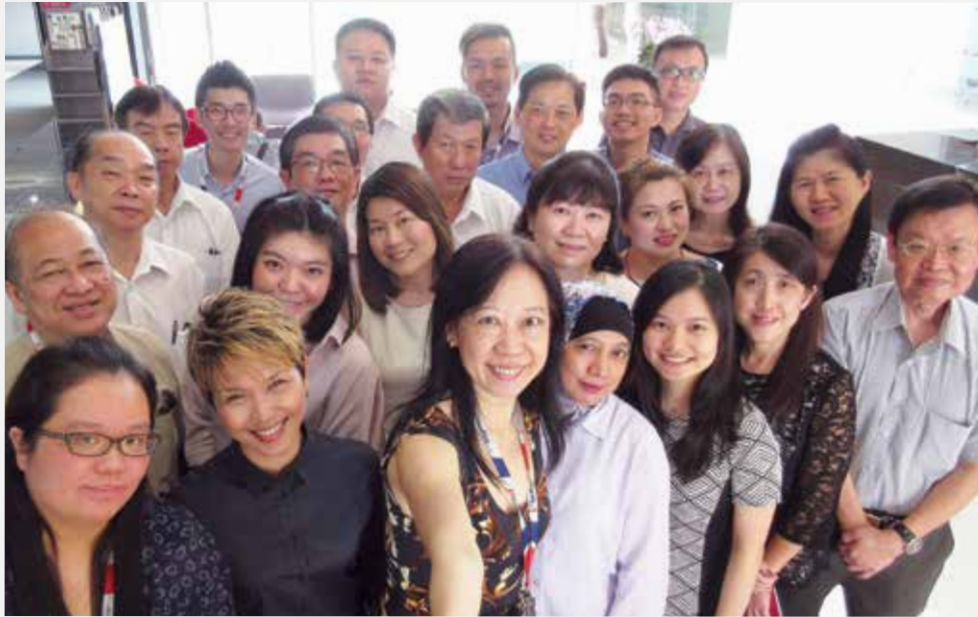
The FairPrice Grocery Purchasing team

A basket of over 1,000 Everyday Low Price (EDLP) popular grocery items are price-checked regularly to give customers the best value.