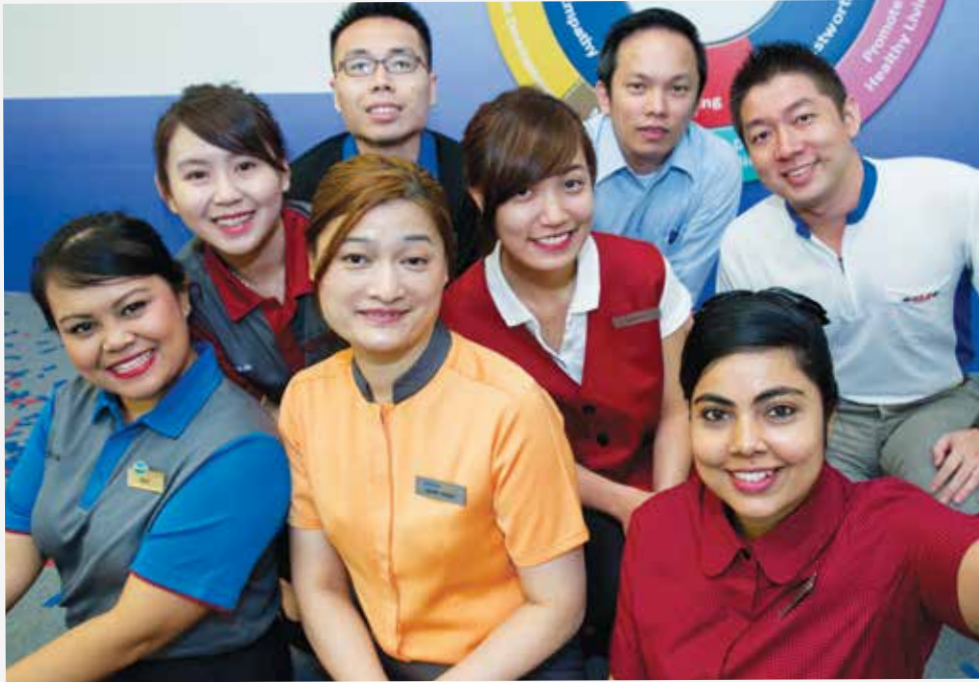
FairPrice staff from the various retail formats

Over 225,000 hours invested in training staff yearly.