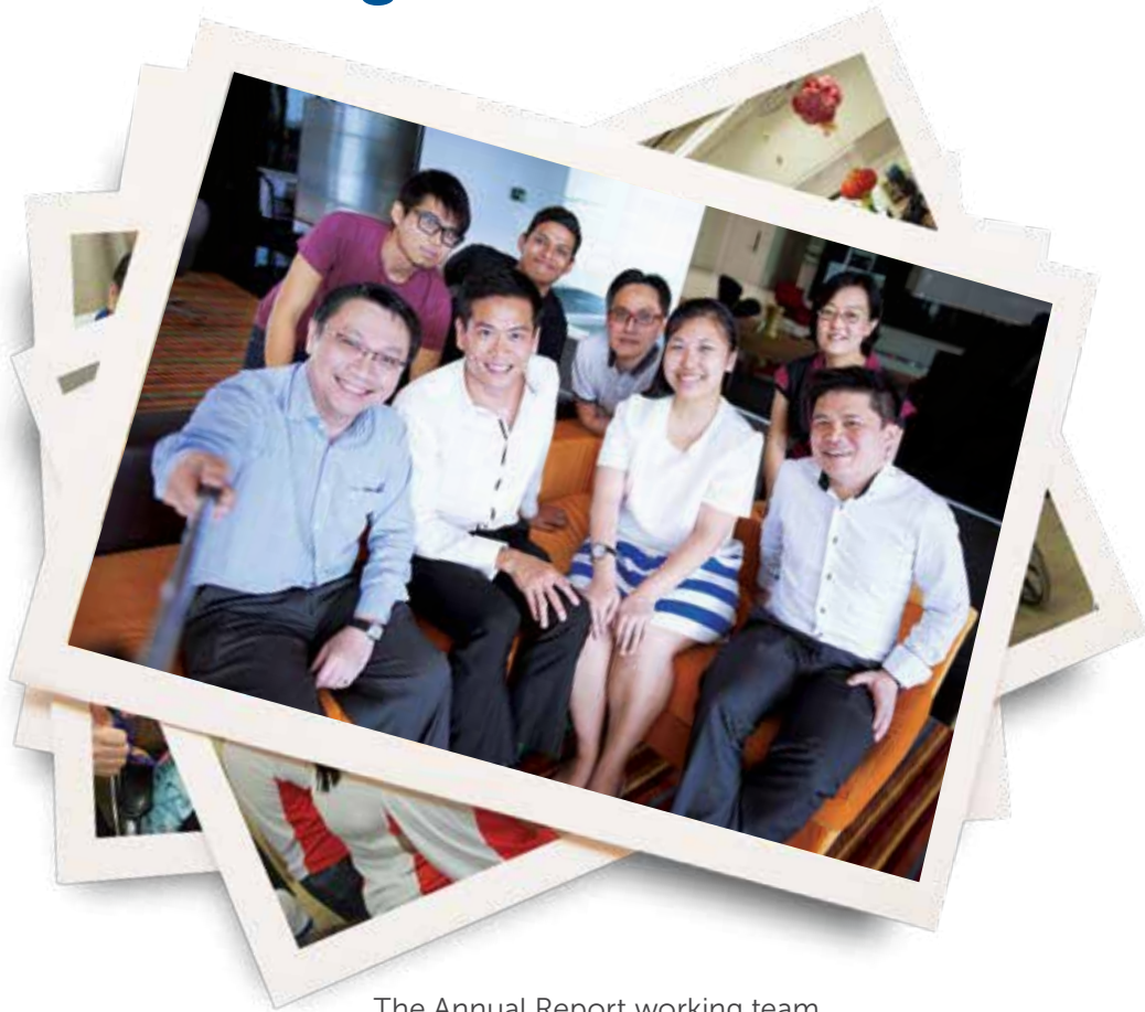
The Annual Report working team