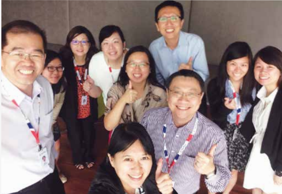
The FairPrice CSR Committee

A key CSR initiative is the Food Waste Reduction Framework that focuses on Processes-Partnerships -Public Education.