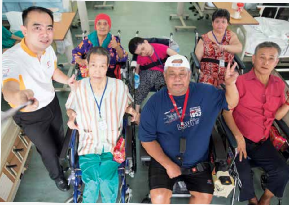
A FairPrice Volunteers Programme activity at Ren Ci Nursing Home

FairPrice has donated over $88 million to FairPrice Foundation to focus its giving efforts to provide a better life for the community. The FairPrice Volunteers Programme has contributed a collective 6,820 hours since its inception.