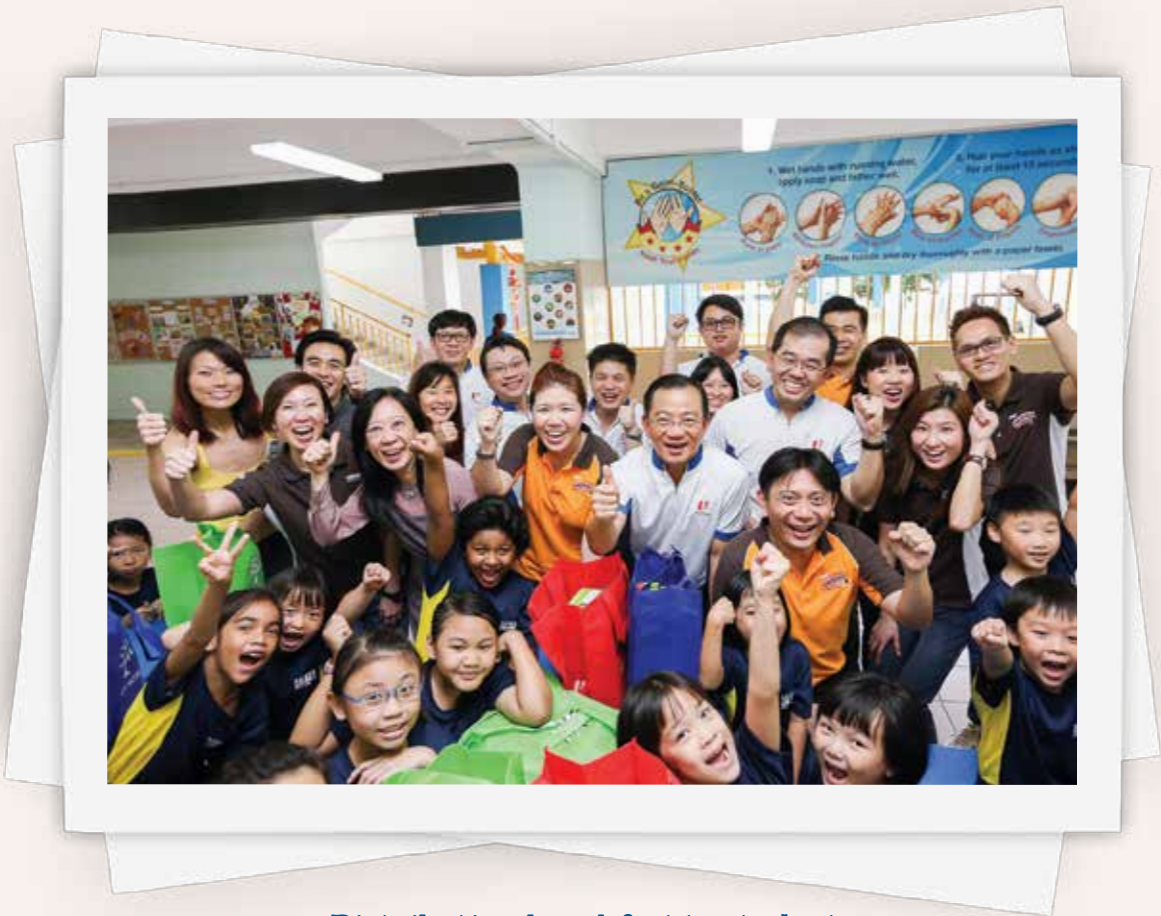
Distributing breakfast to students

FairPrice's CSR partnership with Nestlé saw 180,000 servings of Nestlé cereal and 6,000 packets of FairPrice full cream milk distributed to 1,000 needy children for 6 months.